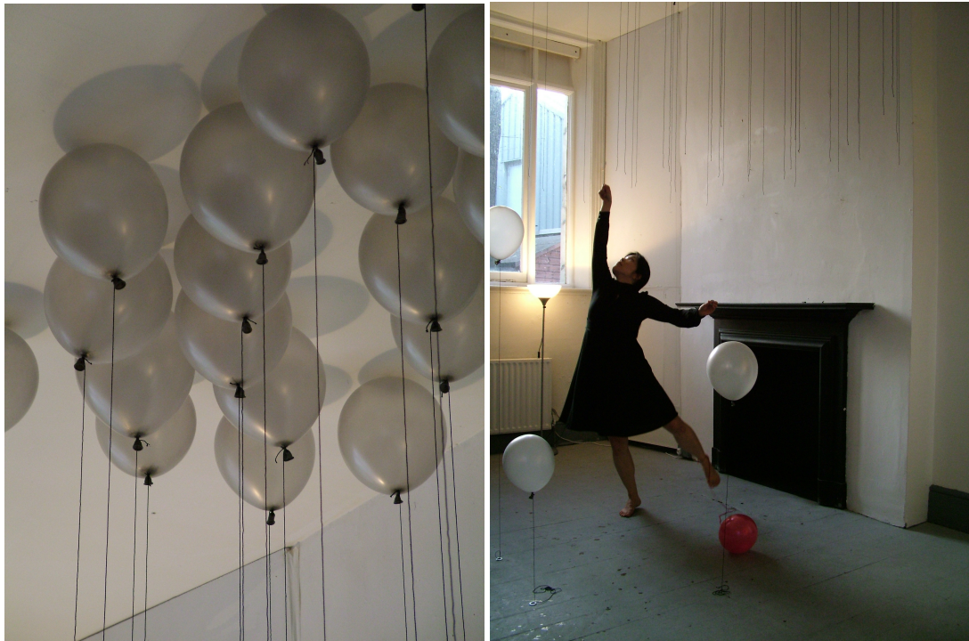
Lighter than the Air , Nolias Gallery, London, 2007

join the ones floating overhead. She reaches up and pulls down the silver, helium-inflated balloons from the ceiling and weighs down each with a metal weight so that they are at various heights above the ground. 2 She calmly pops each silver balloon with a scalpel, and finally gently picks up the red balloon and inserts a scalpel into it. It does not pop, but gradually releases its air.