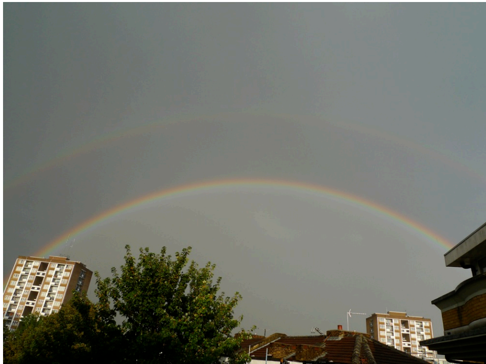
A double rainbow seen from my window.

the comfort of my room. I follow weather changes carefully so I can spot a rainbow. After an afternoon of drizzle, with the evening sun strong enough to be reflected on the windows of a block of flats and come into my room, I wait for a rainbow to appear.