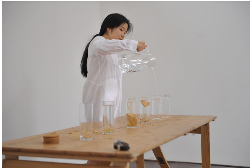
Crumbling Thirst Performance Matters Launch, A Foundation, Club Row Gallery, London, 2010.

to another. She turns two glasses over, lifts the jug to chest height and pours water into one of them. She drops the broken pieces of biscuit into the glasses. She rolls a biscuit over to a third glass, turns it over and presses the biscuit down into it until it can go no further. She pours water until the glass is full. She watches the water dissolving the biscuit and observing it sink to the bottom of the glass. She pours water into the fourth glass, again from a height. She rolls another biscuit over to it and pushes it down into it, without spilling any water. She waits until the biscuit has sunk. She fills the fifth glass with water up to the rim, until it can take no more. She rolls a biscuit over to it and slowly, very slowly pushes the biscuit down into the water-filled glass. Some water flows out as a result. She waits until it sinks. She flips and fills the sixth glass with water, and deliberately knocks the glass onto its side. The water spills on the table. She rolls a biscuit to the puddle and presses it down into the water until it dissolves.