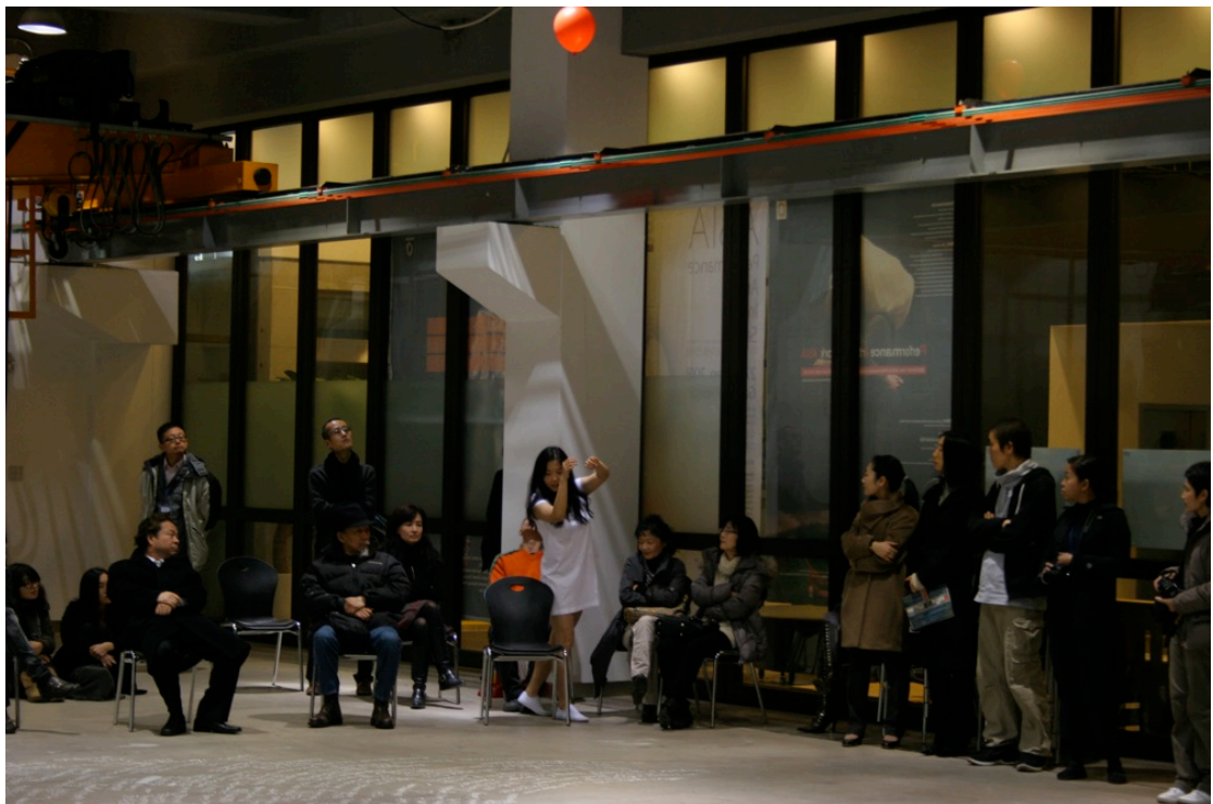
Mulle: A Spinning Wheel Performance Art Network ASIA, Seoul Art Space Mullae, Seoul, 2010.

The performer enters with a spool of thread. The end of the thread is attached to a helium balloon. The performer places the spool on the floor and releases the balloon slowly so that it hovers overhead. She plucks the hanging thread and gradually unwinds it from the spool, in increasingly larger circles. Sometimes she walks