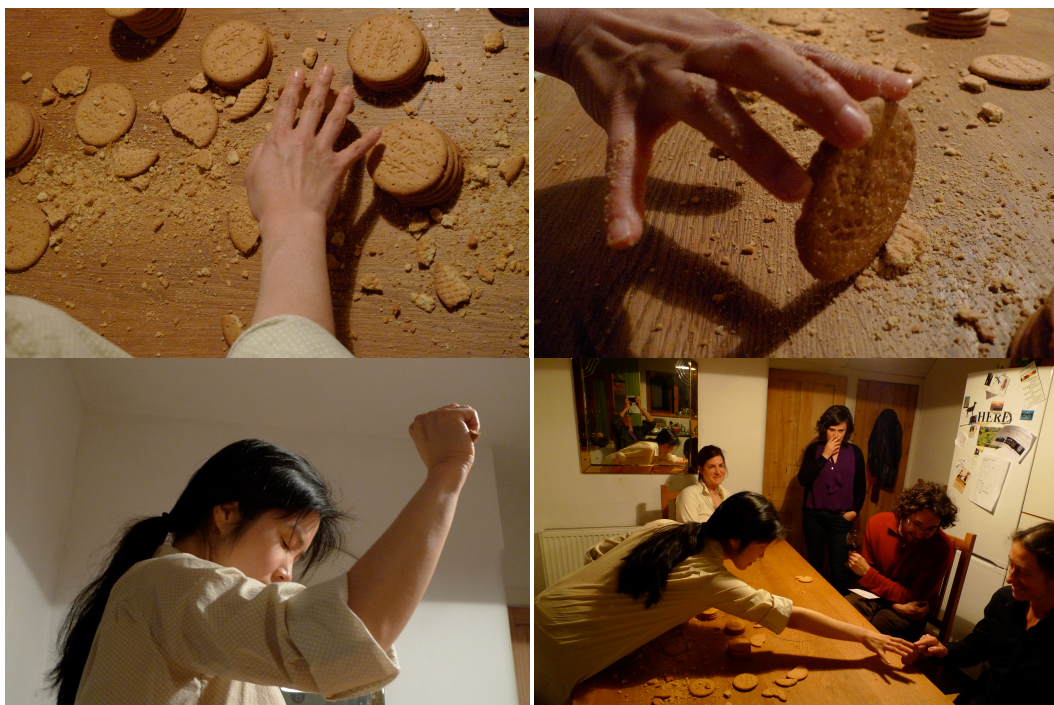
Crumbs of Crumbs , Live Art Salons, Brighton Fringe Festival, Brighton, 2011.

place for the biscuit to be. The performer pauses. She picks up another biscuit on the table and carries on, rolling it with the same fingers she had used before. She palms a biscuit and holds it up by the side of her head. She squeezes slowly. The biscuit resists momentarily, and then crumbles. She picks up another biscuit and starts to roll it on the table, again. There are more crumbs, more obstacles on the table this time.