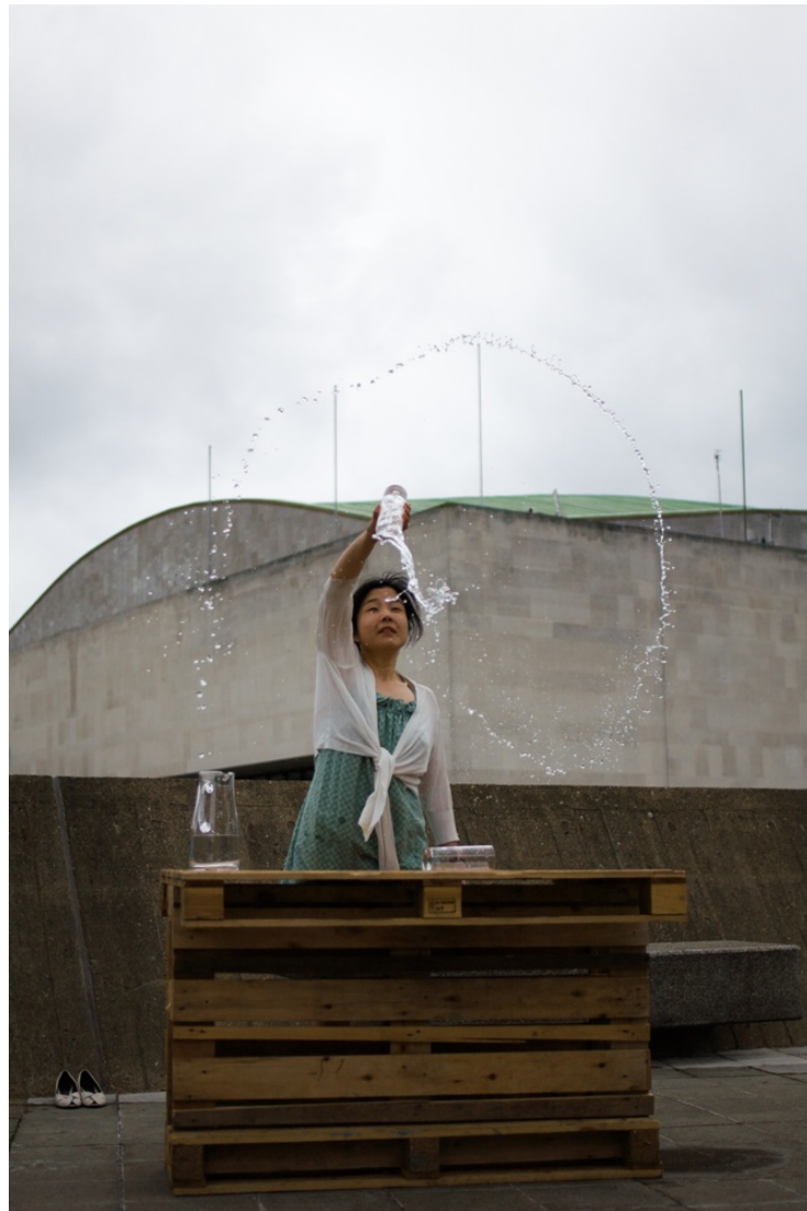
Spill I'm With You, Hayward Gallery, London, 2012.

After my performance of Spill on the balcony of the Hayward Gallery in 2012, spectators came up to me and commented on a watery circle in the air. Some related this pattern to the London Eye behind me. This circle was created by a small flipping motion which absorbed my concentration in performance. From experience I knew that this move would result in drawing an arc in the air, but I did not anticipate the full effect of this action performed in this outdoor space nor really understand why spectators were so impressed until I saw the striking photograph of my performance by Marco Berardi above.